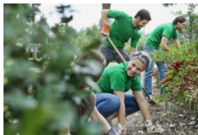
Nonprofit & Education