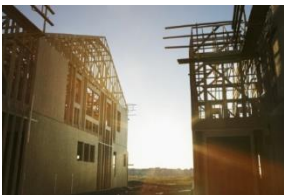
Real Estate & Construction