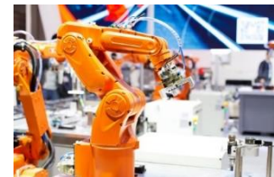
Manufacturing & Distribution