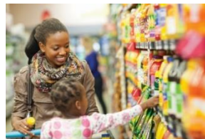
Retail & Consumer Products