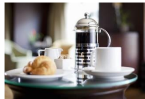
Gaming, Hospitality & Leisure