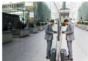
Financial Institutions & Specialty Finance